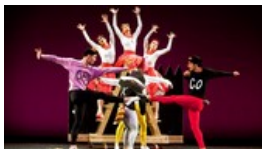
Mark Morris and His Joy of Text