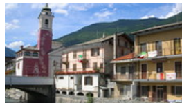
Italian Protesters Rail Against Train Project