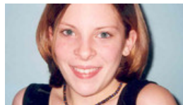
Tabloid's Pursuit of Missing Girl Led to Its Own Demise