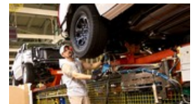
Policy, Geography Boost Texas Job Growth